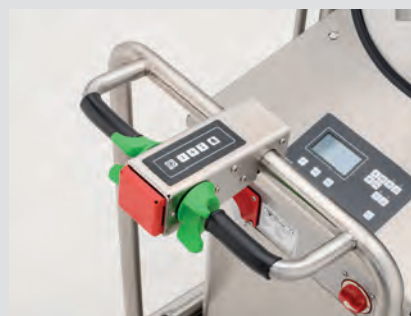
Drawbar head (pushing version)

The drawbar head - no matter if pulling or pushing - has all the important functional keys for the operation of the dosing unit, adjustment and selection of the feeding amount and the change of the driving level.