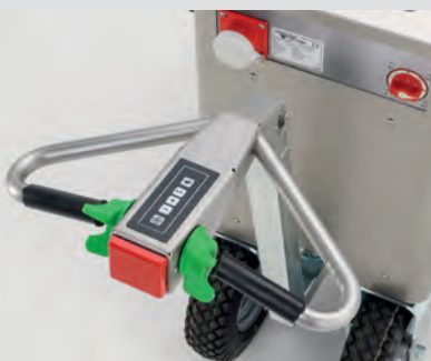
Drawbar head (pulling version)

A shorter wheelbase and the round design enable an easier, safer, more agile driving in all conditions. Additionally, the MilchMobil NEXT is available as pulling model (200 & 300 liters) and as pushing model (120 & 200 liters). Thus, an ideal solution to any requirement is created.