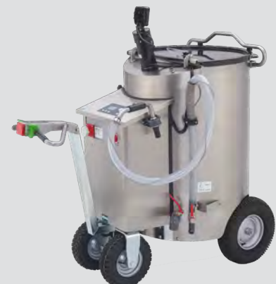
300 liters, pull