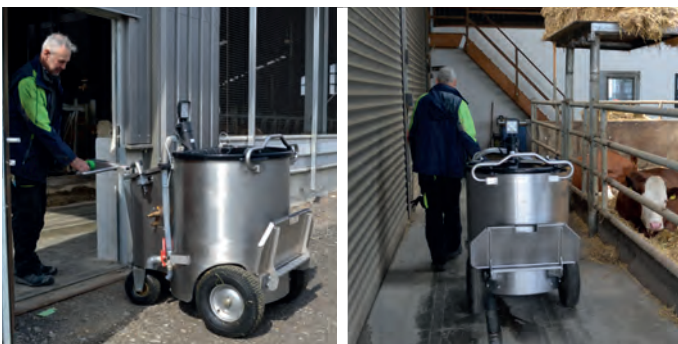
The four wheels and the electric drive ensure optimum driving stability - no matter where.