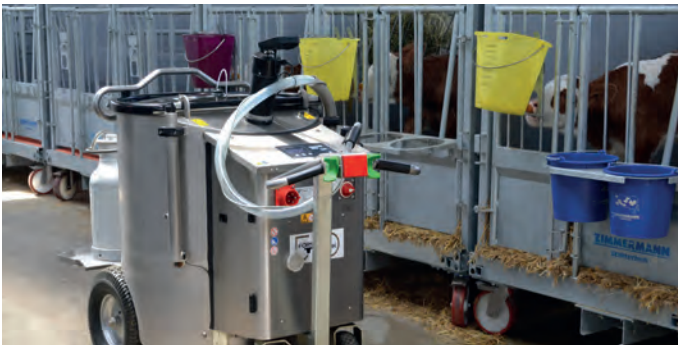
The ideal solution for feeding calves in individual boxes.

2-stage agitator, 8,0 kW water bath heating, circulation cleaning, portion control, 2-stage electric drive and MR-calculator.