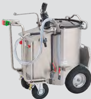
120 liters, push

The MilchMobil NEXT impresses with many new functions and equipment options that are essential in the daily farm life. It is available as 120 and 200 liters model with and without cooling floor and as 300 liters model without cooling floor. Depending on the type, the MilchMobil NEXT can be pushed or pulled.