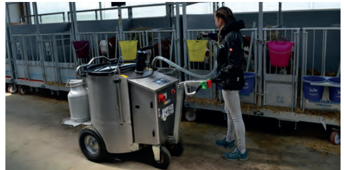
The desired feed amount is dosed precisely at the push of a button.