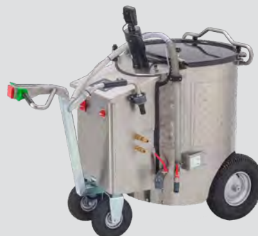
200 liters, push & pull