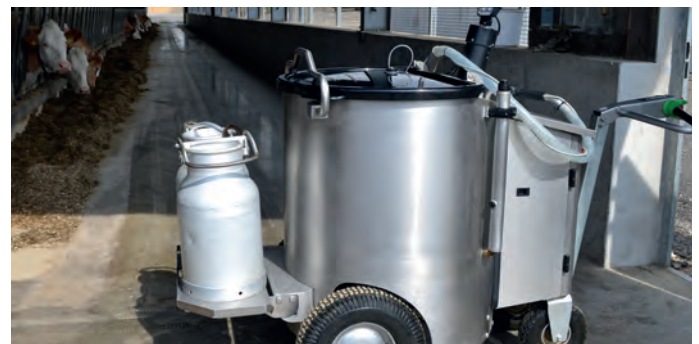
The optional foldable holder simplifies the transport of multiple milk jugs or buckets.