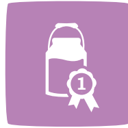
MILK QUALITY AND ANIMAL HEALTH