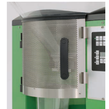
Optional fly protection screen

Flies will buzz off The fine-pored fly screen for the mixer prevents flies from getting into the feeding box. Steam that arises in the feeding box can easily escape because of the large size of the box and through the pores; condensation water is easily prevented this way.