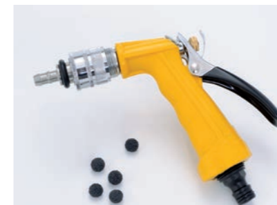
Hose cleaning pistol

Easy cleaning The semi-automatic mixer cleaning system is efficient and easy to operate. At the press of a button you have water with a high temperature at your disposal. The open, tiltable feeding box is easily accessible and makes it possible to easily do a function check at any time. You can easily remove deposits in the suction hoses with the help of the hose cleaning pistol and also clean longer hoses with no trouble.