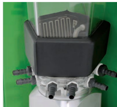
Mixer heating system available as an accessory

Reliably at the right temperature The boiler, which has a temperature sensor, an electronic heating regulator and a minimum temperature monitor, ensures that the feed always has the right temperature, and can be easily configured and checked.